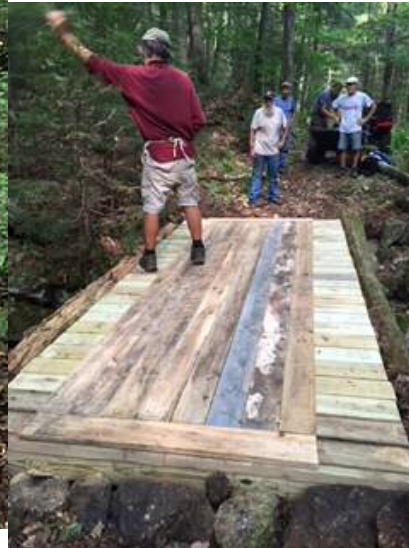
Rebuilding Parker Hill Trail Bridges