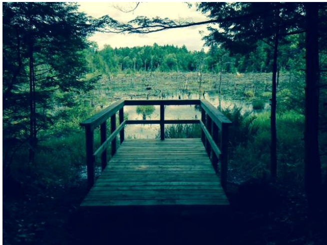
New Viewing Platform on South Woods Trail