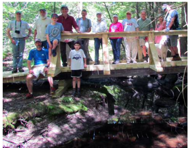
Southwoods Bridge Building Crew After New Bridge Completed