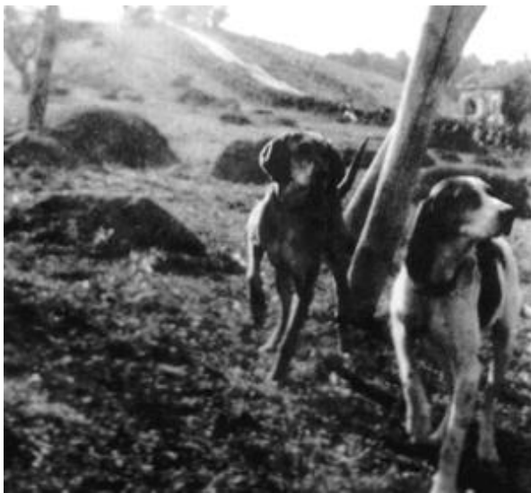
Doolittle Dogs at Bottom of Old Chesterfield Rd North of Present Visitor Center. Note stone walls both sides of road and Cider Mill in right background