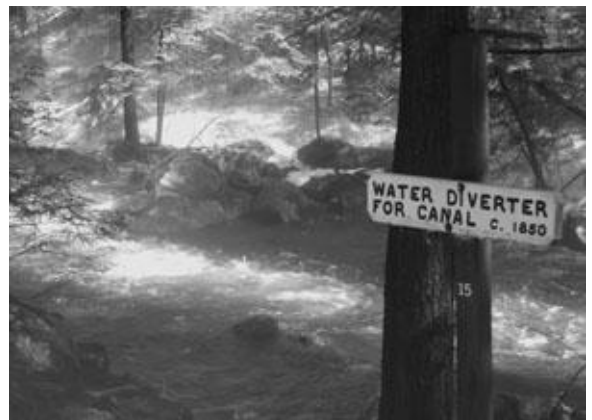
Water Diverter Channel for Canal c.a. 1850. Note water in front and snow in far back.