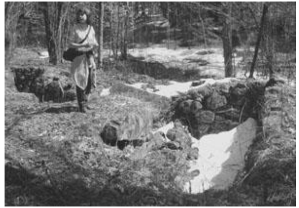
Laurel Powell at Old Cellar Hole Broad Brook Rd. Note snow still on ground.