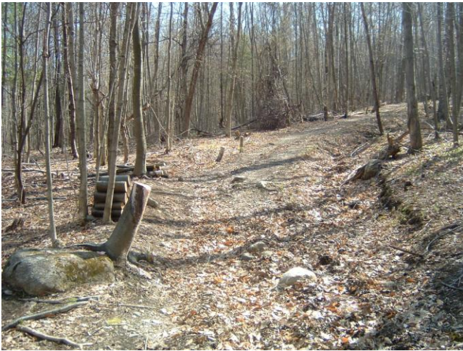
Hubbard Hill Trail Widening About 300 yds from Winchester Rd