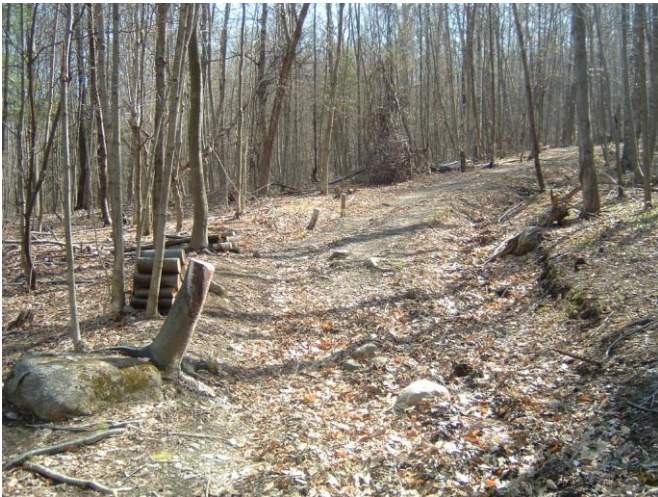
Hubbard Hill Trail Widening About 300 yds from Winchester Rd