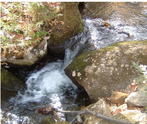
Stream Along Road Near Start of Southwoods Trail