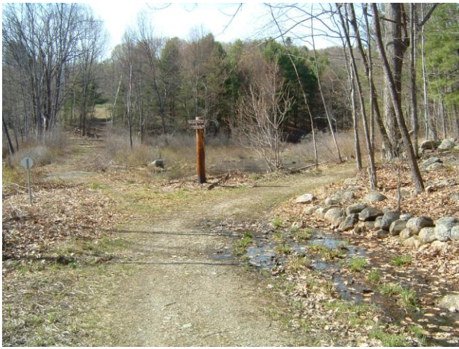
Junction of Old Chesterfield Rd and Horseshoe Road in Pisgah. These roads and the trails generally looked pretty good to me in April., contrary to some statements from Parks & Recreation.